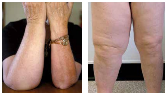
Lymphoedema in the arm (left) and leg (right)

If you have had treatment for head or neck cancer, symptoms of lymphoedema include: